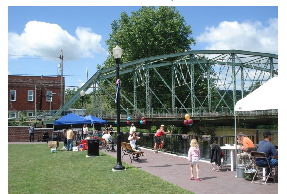
Simeral Square, a riverfront park that overlooks the Youghiogheny River

The concept, says George: "Let's create this little buzz on the other side of the river so people could look across and say, 'There's something happening over there, let's go across.'"