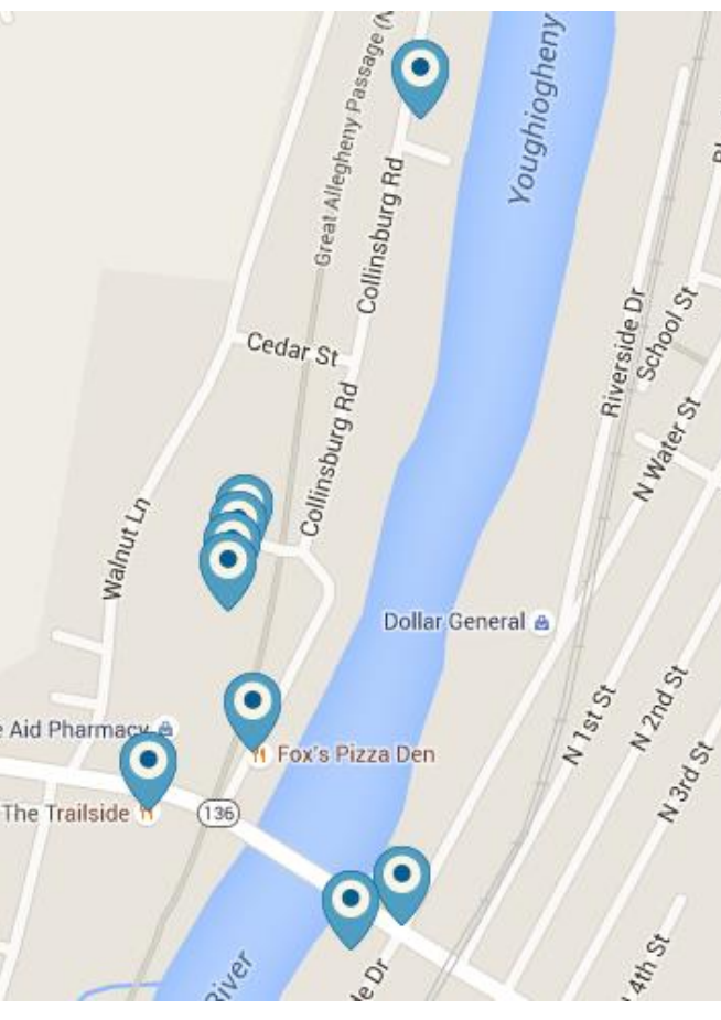
The West Newton Trailhead