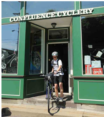
With help from a $50,000 loan from the Progress Fund's Trail Town Program, an old department store was transformed into a cycle shop and lodging.

Trail Alliance, cites several more examples of trail-inspired "reinvention," including Confluence, Pennsylvania, a village at the convergence of three waterways with a town square, Victorian bandstand, and a population of just 777. Here the Progress Fund arranged a $175,000 loan for the Confluence House B&B, where over 60 percent of the guests come off the trail, according to co-owner Sandy Younkin.