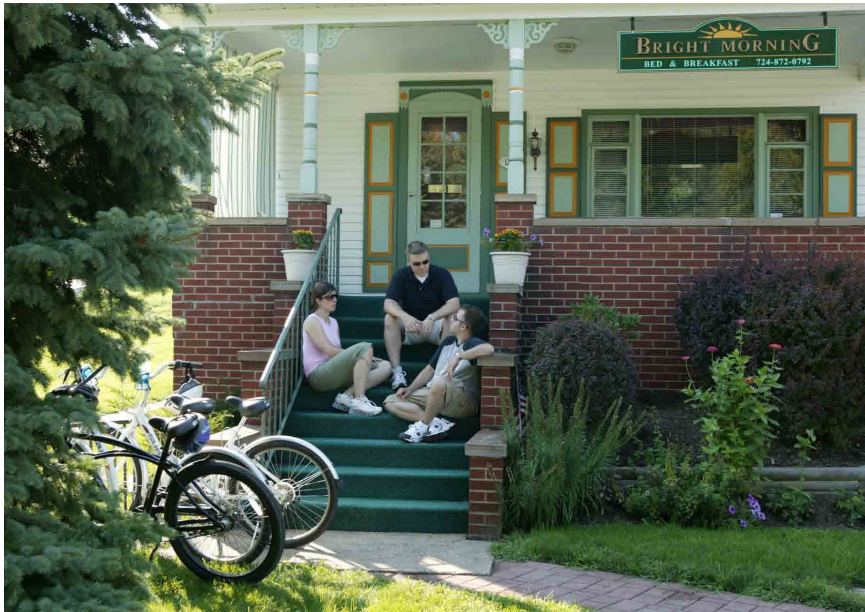
This bed and breakfast in West Newtown, Pennsylvania, recently expanded by acquiring the historic house next door, thanks to funding from the Progress Fund.