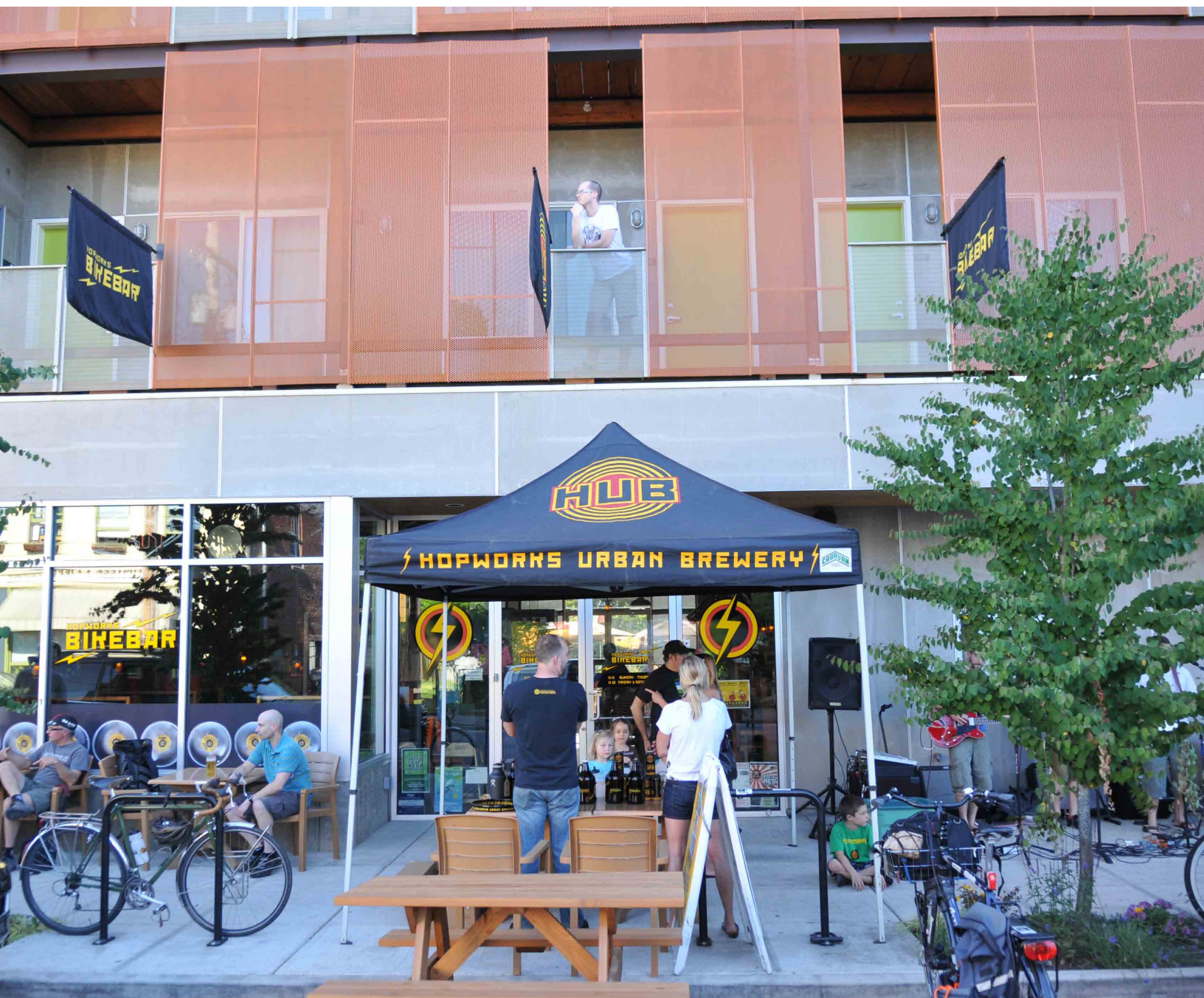
Riders on Portland, Oregon's busy North Williams bike corridor can stop for a beer at the HopWorks Bike Bar and move on—or they can move in. The multiuse building includes 18 green apartments aimed at cycling enthusiasts (there is no dedicated car parking).

floor brewpub called the HopWorks Bike Bar and upper floors are occupied by Eco-Flats, an 18-unit apartment complex with no dedicated vehicle parking other than bike racks in the lobby.