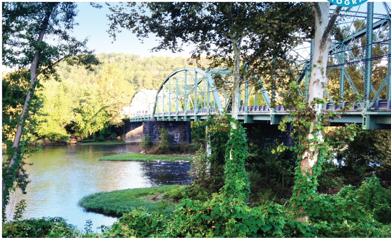
View from inside building's back porch